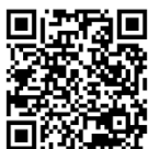
Apple Pie Sign-up Genius

Please sign up at the link under "News & Events" on the main FPC website page, or by using this QR code.