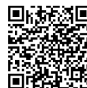
Visiting & Learning about FPC

♥ Check out our website, www.fpc-stow-acton.org There is so much happening at FPC! Visit our homepage and the "Church Life" tab to learn about our events & programs.