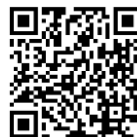
Subscribe to E-Newsletters