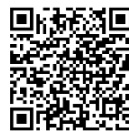
Visiting & Learning about FPC