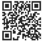
Plate Sharing This Month: Supporting Asylum Seekers

The Supporting Asylum Seekers group is an active part of the Social Justice work of FPC. We work to support asylum seekers and refugees who seek a safe home in our surrounding communities. We greatly appreciate the Congregation's ongoing support and plate sharing!