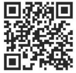
Plate Sharing This Month: Supporting Asylum Seekers

The Supporting Asylum Seekers group is an active part of the Social Justice work of FPC. We work to support asylum seekers and refugees who seek a safe home in our surrounding communities. We greatly appreciate the Congregation's ongoing support and plate sharing!