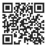
Plate Sharing This Month: Supporting Asylum Seekers

The Supporting Asylum Seekers group is an active part of the Social Justice work of FPC. We work to support asylum seekers and refugees who seek a safe home in our surrounding communities. We greatly appreciate the Congregation's ongoing support and